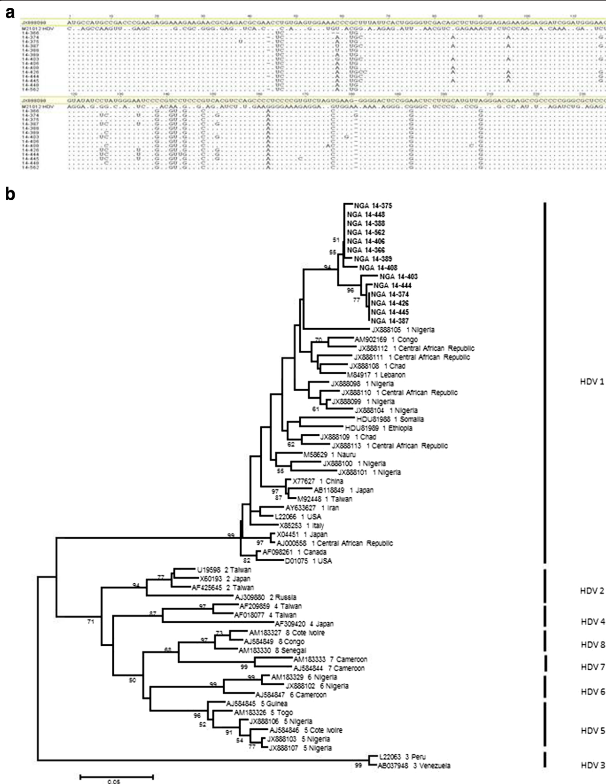
Fig. 2 (See legend on next page.)