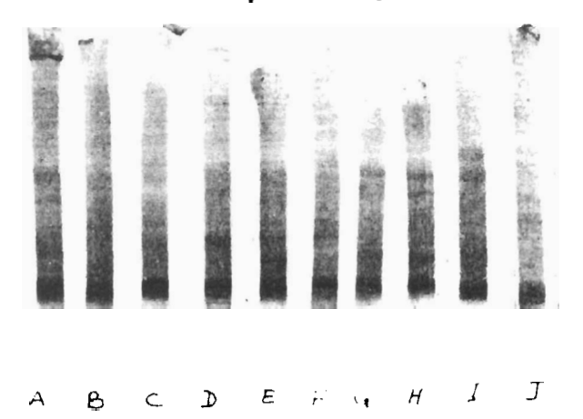
Plate 1: Electrophoretic characteristic of Hibiscus species studied, showing their protein distribution (A - J as indicated in Table 1)

Interspecific bands were observed between pairs of species in the taxa studied as shown in Table 2. The following pairs of species have the highest number of common bands (nine). H, vitifolius var. vitifolius and H. lunarifolius; H. lunarifolius and H. surattensis; H. sabdariffa and H. physaloides; H. lunarifolius and H. sterculiifolius . The least number of bands (three) occur between H. tiliaceous and H. vitifolius var vitifolius.